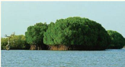
Mangrove forest, Pichavaram 39 Kms