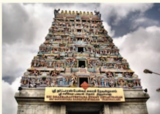
Tirunallar Saneeswara Bhagavan Temple 3 Kms