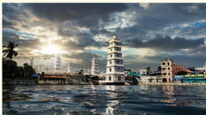
Dargah at Nagore, 22 Kms