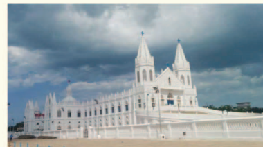
Velankanni Church, 39 Kms