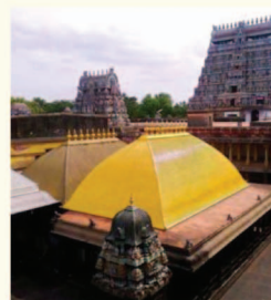
Nataraja Temple, Chidambaram, 60 Kms