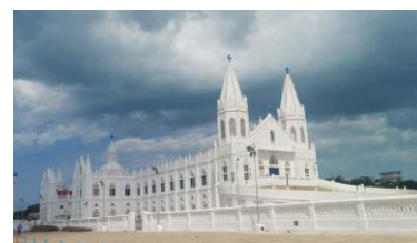
Velankanni Church, 39 Kms