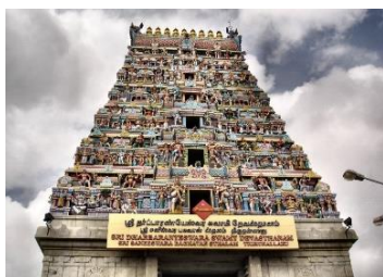
Tirunallar Saneeswara Bhagavan Temple 3 Kms