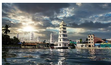
Dargah at Nagore, 22 Kms