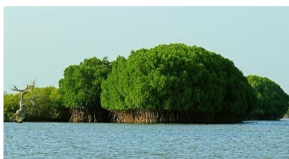
Mangrove forest, Pichavaram 39 Kms